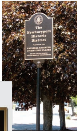
High Street (from the east)