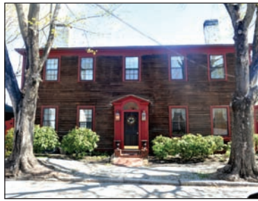
Clockwise from top left: 37 Temple Street, 93 High Street, and 77 Prospect Street.

At right are the first three homes researched by the NPT Historic House Plaque Program. During Preservation Week, guides presented exterior tours based on the research. For more details about the program, visit www.NbptPreservationTrust.org .