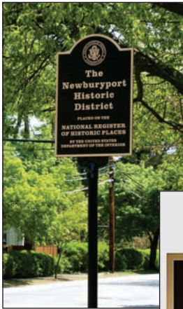
High Street (from the west)