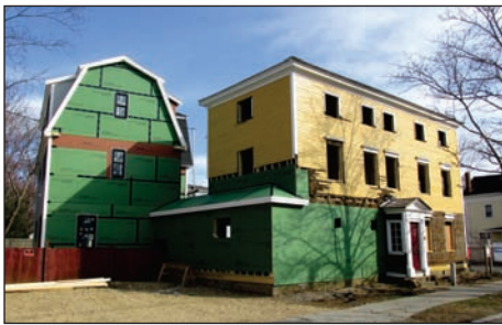
Above is a city-approved "one-structure"(!) multi-unit development on Lime Street that has prompted proposed zoning amendments.