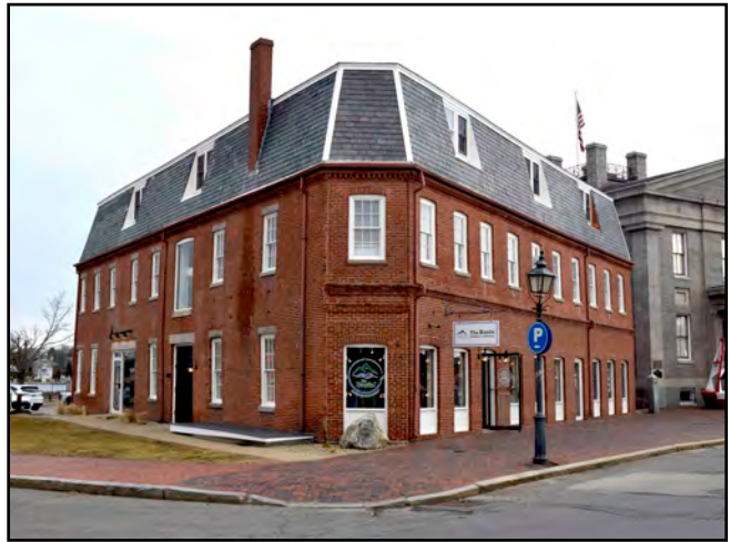
The same building today.