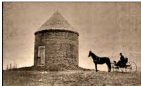
The 1822 Powder House on Low Street.

interpretive plaques in nearby Garrison Gardens.