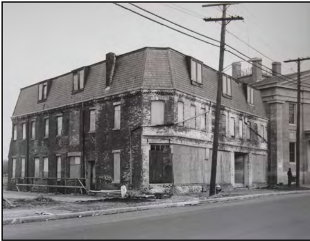
Boarded-up building on Water Street in the 1970s.