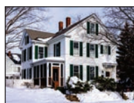
At left is the Oakland St. house before crews from This Old House began their work.

The program is made possible by a Bridge Street Grant via the Massachusetts Council on the Humanities. ■