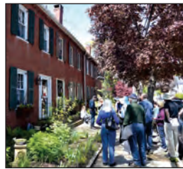
At right: More views of a busy Preservation Week 2019.

Preservation Week is an annual event of the Newburyport Preservation Trust to celebrate the city's historic character and architectural legacy. Do you have ideas for Preservation Week 2020? Don't keep them a secret. Share them with the NPT board. Let's keep the conversation going. ■