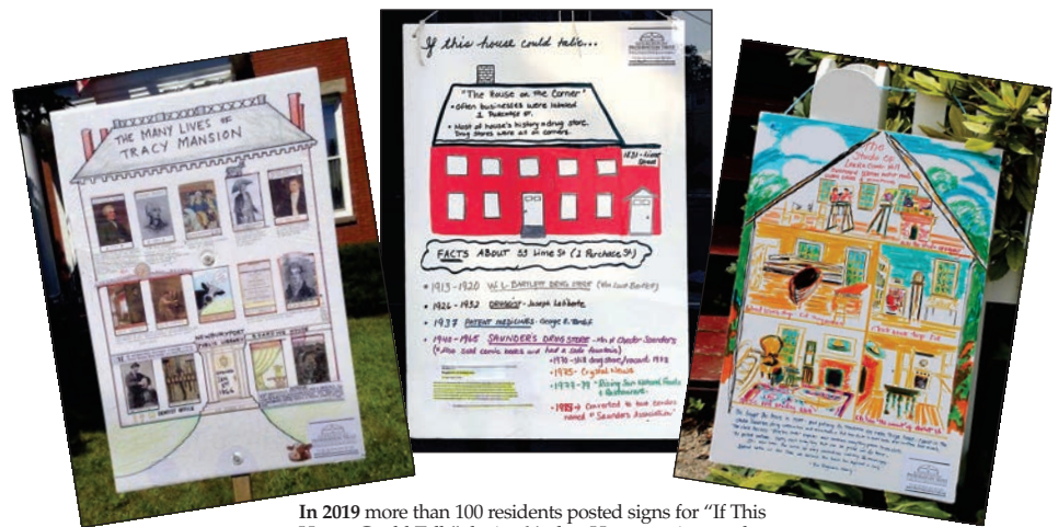
In 2019 more than 100 residents posted signs for "If This House Could Talk" during Yankee Homecoming week.

NPT thanks all coordinators, volunteers, participants, and strollers for keeping this fun event alive in this difficult year. ■